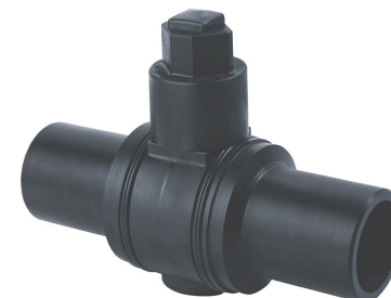
Ball valve 50 ÷ 315