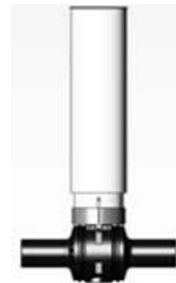
“Kit” with PVC telescopic extension and stem extension