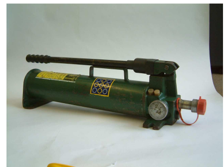
manual hydraulic handpump